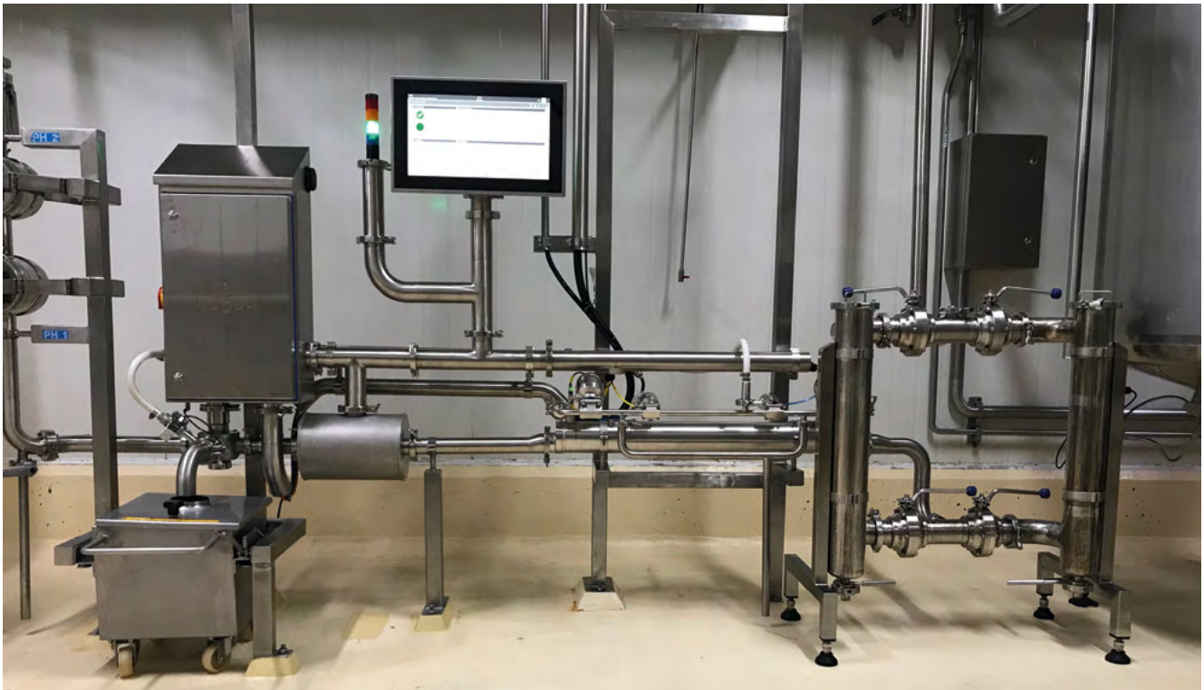
Fig. 1: The Food Radar system gives cutting-edge protection using an entirely safe but highly effective microwave technology.

The Food Radar is unlike any other food safety technology. Specially devised to maximise the quality of pumpable food products such as baby food, sauces, soups, fruit preparations and desserts, the Food Radar sets a new standard of safety for food manufacturing. Whereas other