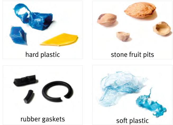
Fig. 3: Typical low density foreign bodies. The Food Radar can detect glass and metal as well.