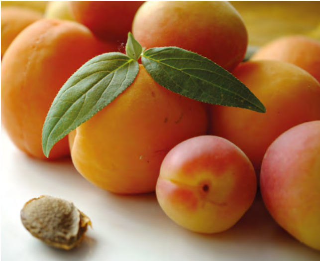
Fig. 2: Typical stone fruit for processing